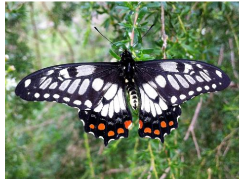
Swallow tail Butterfly

Note that the Information Centre is open on the last Sunday each month from 2.00 – 4.00 pm.